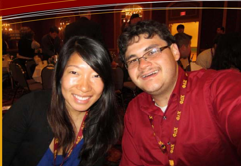
Phi Delta Chi - Gamma Theta - 68th Grand Council